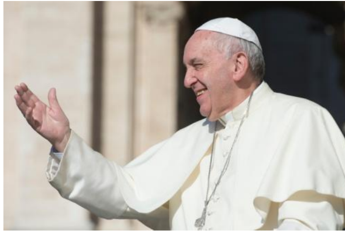
Jorge Mario Bergoglio 1936-2025

Born: December 17, 1936 Ordained Priest: December 13, 1969 Bishop: May 20, 1992 Cardinal: February 21, 2001 Pope: March 13, 2013 Died: April 21, 2025